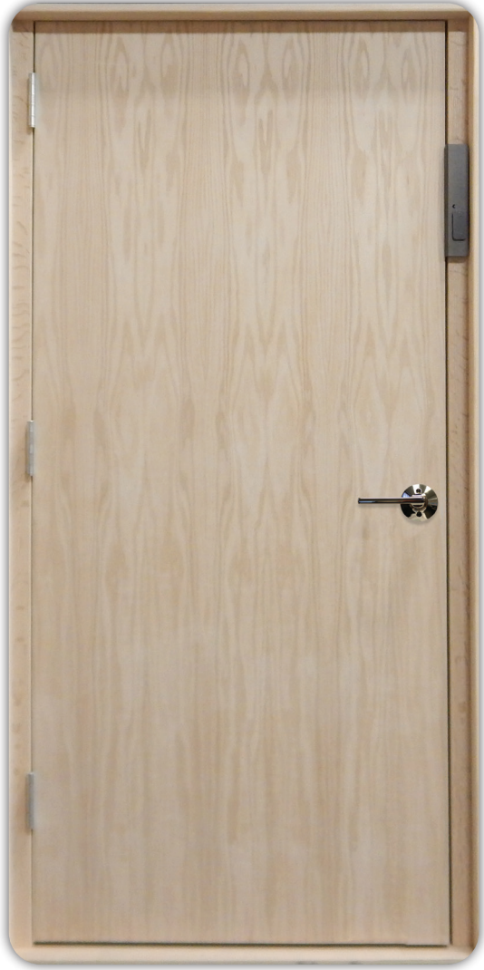
Flush Door Frame with EMDL and Latch Guard (Door by others)