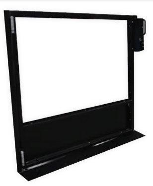
36" Tall Upper Landing Gate in Black