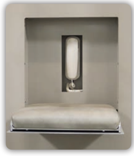
Slimline Phone and Flip Down Seat