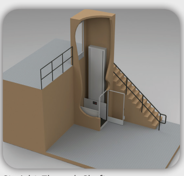
Straight-Through Shaftway Application Shown