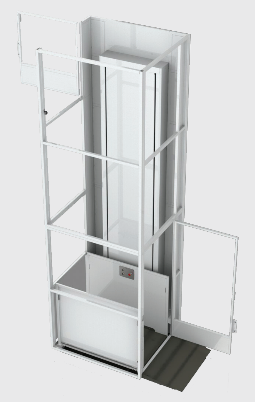
VPL-ELP shown with acrylic enclosure infill panels

VPL-EL & VPL-ELP for Residential & Commercial Applications